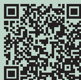
CS, LS, ECS